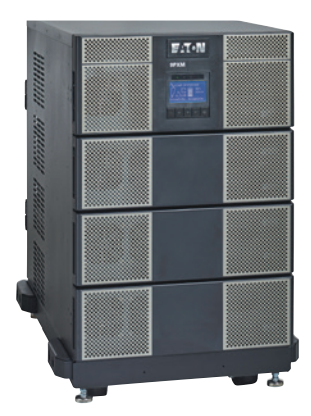
8-slot cabinet is scalable to 16 kVA in a 14U cabinet