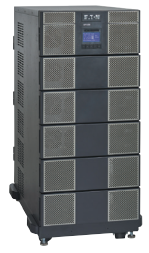
12-slot cabinet is scalable to 20 kVA (N + 1) in a 21U cabinet